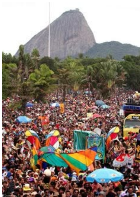
Carnaval in Rio de Janeiro

If you are in Brazil now, you are probably emerging from the chaos and ecstasy of Carnaval. The streets that were overflowing with music, dance, and joy are now quiet. The energy has shifted. Ash Wednesday marked the official end of the celebration, a moment of transition where many return to their routines, while others extend the holiday season just a little longer, stretching this liminal space between indulgence and responsibility. It is a strange yet familiar sensation—the feeling of suspension, of time slowing down, of everything hanging in the air before life resumes its normal rhythm.