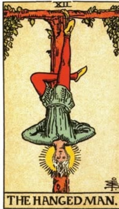
Raide Waite-Smith Tarot Deck

something unusual—the figure in the card is not struggling. He is upside down, yes, but his face is serene. His hands are often behind his back, signaling a state of surrender rather than resistance. He is not trapped; he is in a state of voluntary suspension.