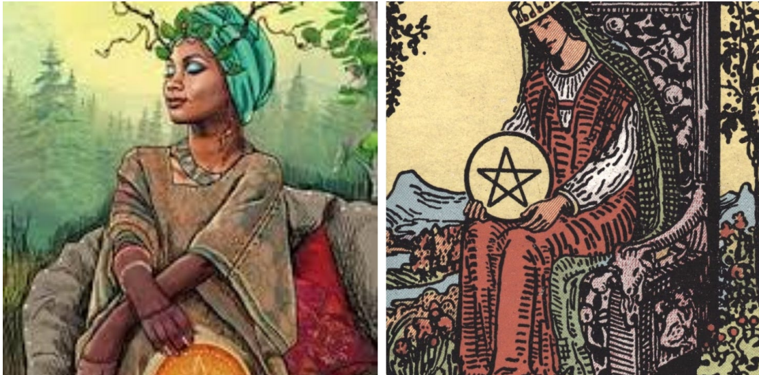
Queen of Pentacles in Lightseers Tarot and Raide Waite-Smith Deck

Like the lotus, this queen does not fight her surroundings . She flourishes despite them .